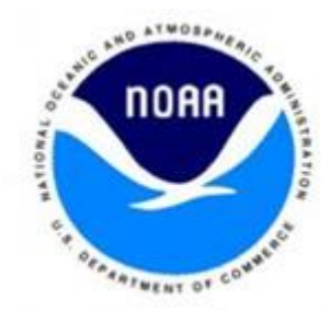
Figure 4: NOAA Symbol

3.1.32 The radiosonde shall have at least one NOAA Symbol Label shown in Figure 4.